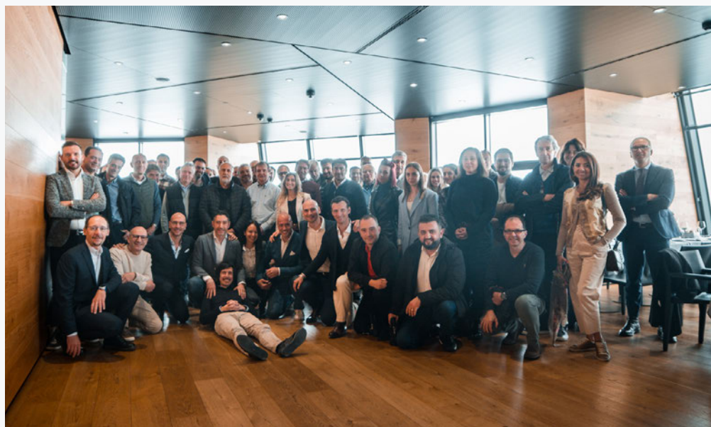
FIG. 3-4 Moments from the Monte Generoso Congress 2023.

“The role of the DDS ambassador is to gather all the energies present in the area and transform them into concrete projects.”